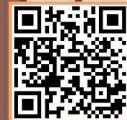
Scan QR For Registration

For any queries, write to us at : ntac@lloydlawcollege.edu.in